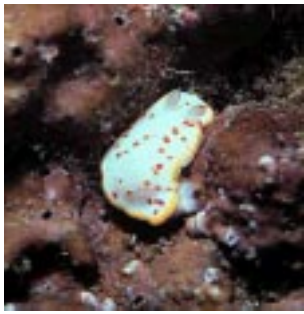
Fig. 6 N. haliclona