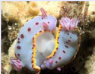
Fig. 4 H. bennetti