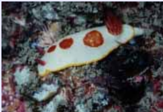
Fig. 2 C. splendida