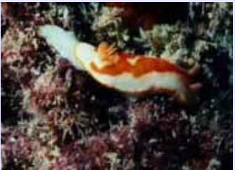
Fig. 3 C. splendida