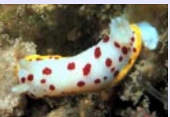
Fig. 5 C. hunteri

Several red spotted chromodorids are to be found on Australia's east coast, some endemic, others found throughout the Indo-Pacific. There are three body colours in this group; white, pink, blue. At first glance it is easy to mis-identify these species. Outlined below is a general guide to the most common species that occur between Mooloolaba, southern Queensland & the southern New South Wales border. C. tumulifera Collingwood, 1881, would fit into this group except it does not occur any further south than the Great Barrier Reef.