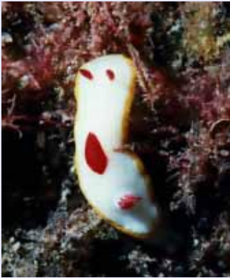
Fig. 1 C. splendida