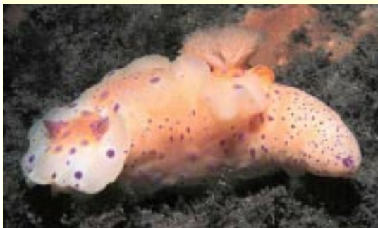
Ceratosoma brevicuadatum photographed at Fly Point, Port Stephens, NSW, Australia

http://www.austmus.gov.au/science/division/invert/mal/forum/cerabrev.htm